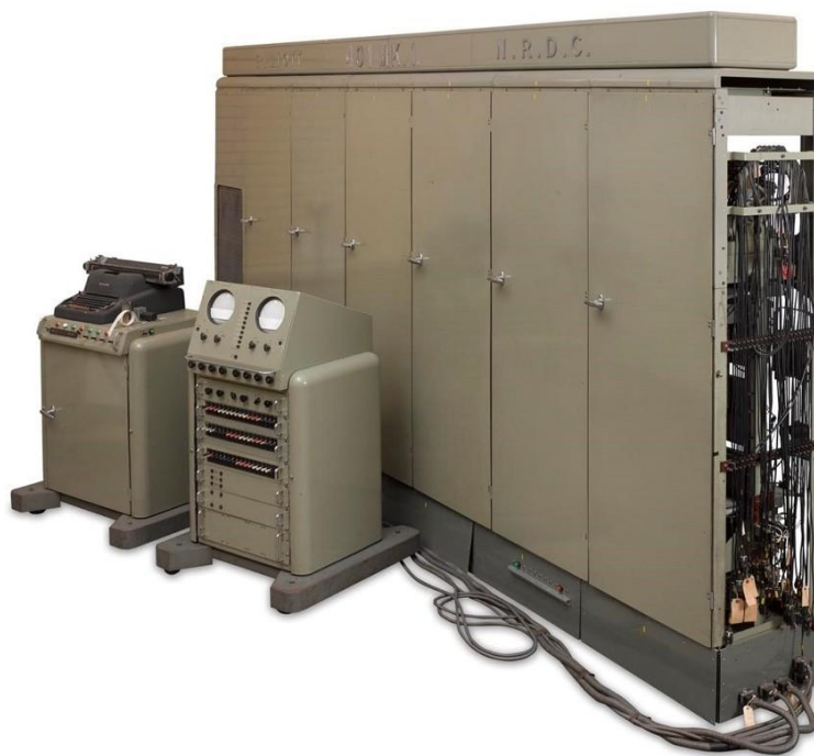
Figure 2: Elliott/NRDC 401 Computer c.1953