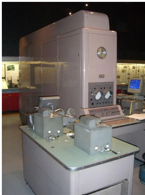
Figure 3: Ferranti Pegasus 1959

By November 1953, the NRDC had decided to build the Pegasus, a medium-scale, low-cost package computer with Ferranti Ltd.