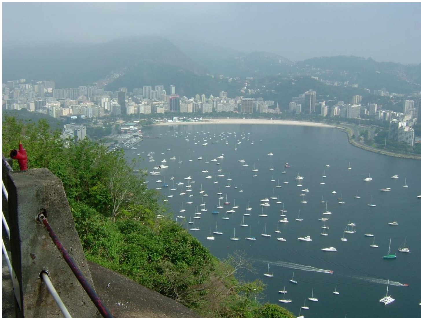
Part of Rio de Janeiro from Sugar Loaf Mountain