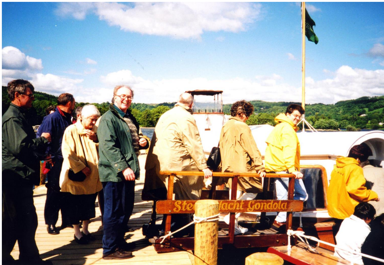
Members of the Executive Committee and their wives boarding a steam launch on Conniston Water, in Britain's Lake District, in April 2000