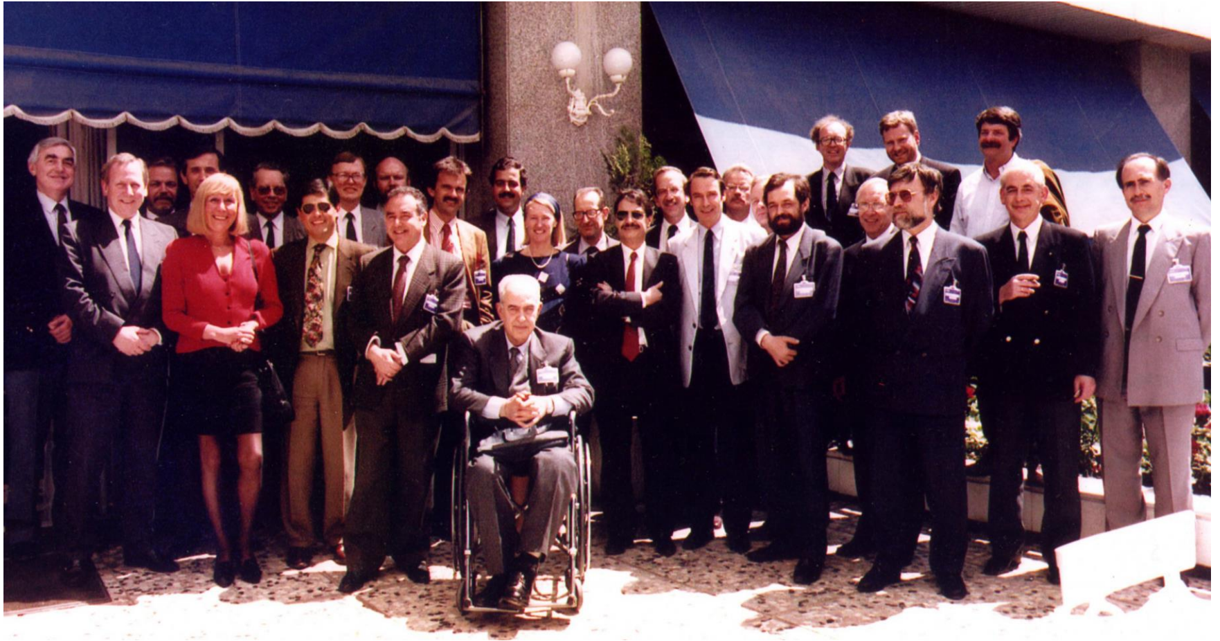
Members in Seville in April 1991