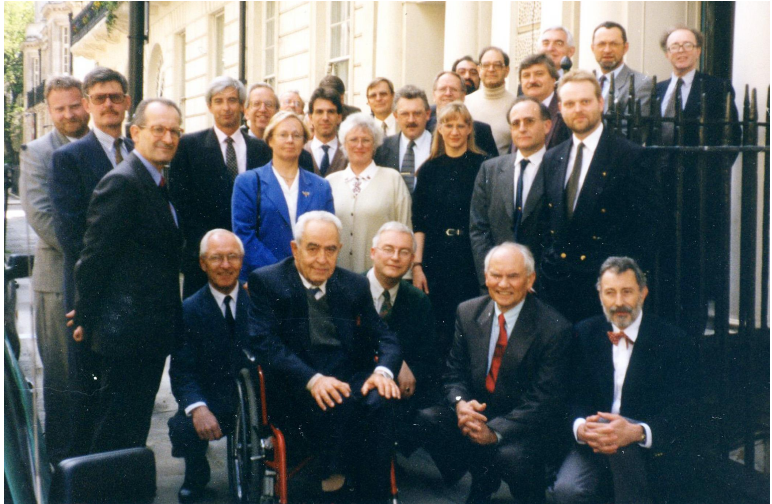
Members of CEPIS Council on the steps of the BCS Offices in London in 1996