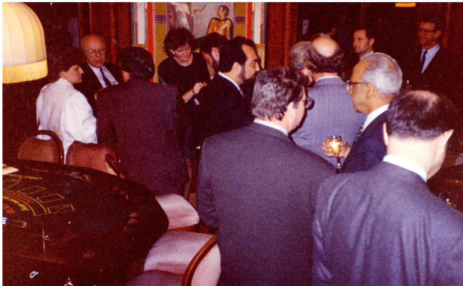
Vienna in March 1993, when IFIP and CEPIS signed an agreement of cooperation: a reception at the City Hall